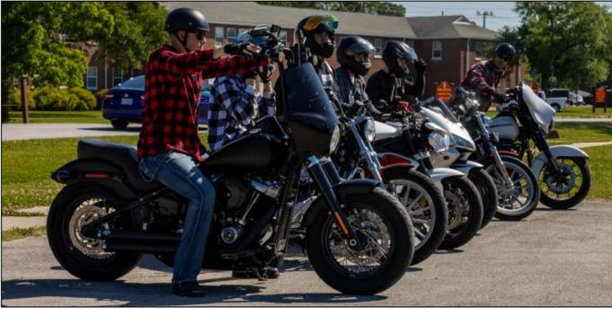
U.S. Marines with 2d Marine Division (MARDIV) participate in a motorcycle awareness event on Camp Lejeune, North Carolina, April 21, 2023.